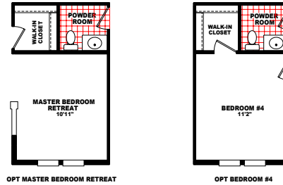
MODEL: XL-4068A OPTIONS PAGE