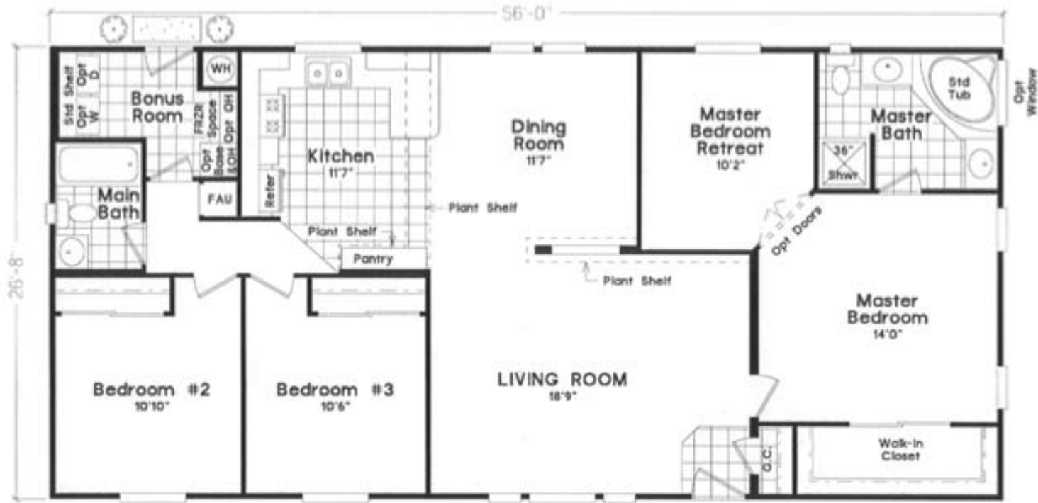
MODEL: XL-2856D Approximately 1493 Sq. Ft. 3 Bedroom, 2 Bath